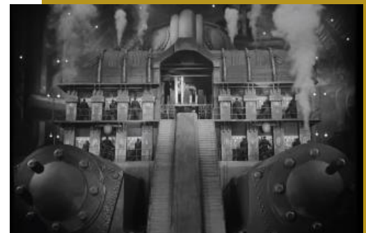
Metropolis de Fritz Lang, 1927