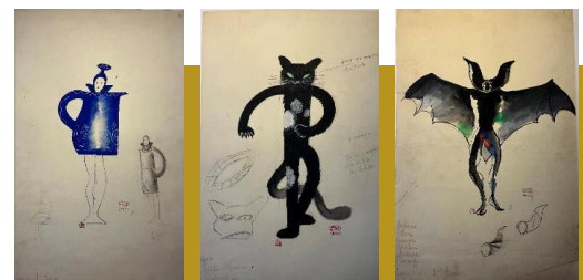
Paul Colin, L'Enfant et les Sortilèges, costumes' sketches, 1939

The exhibition finally explores Maurice Ravel's various inspirations . First, it examines his connection to Spain through his Basque mother and his passion for this country, which permeates his entire work. The carefree boldness of Ravel's music is also explained by his unique relationship with childhood , which he captures in a poetic, sometimes almost nostalgic way in several of his compositions. Finally, inspired by his father, an engineer, Ravel developed a passion for machines of all kinds . For Ravel, each composition is like a perfectly tuned machine, which is particularly true for Boléro and its impeccable mechanics.